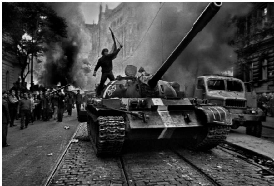
Prague 1968.