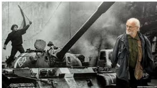
Josef Koudelka, Courtesy Getty Museum